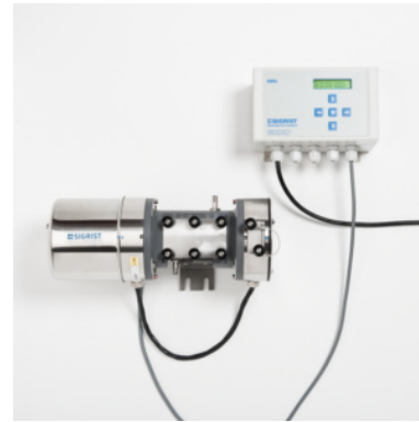
Picture: ColorPlus Bypass with 100mm PVC measuring cell

with UV absorption and shown in E/m. Typical values are 0 to a few E/m. Depending on the requirements of the individual countries a respective reaction is necessary. The SIGRIST instrument can measure up to 30 E/m (with the 100mm PVC cell) and up to 60 E/m (with the 50mm PVC cell).