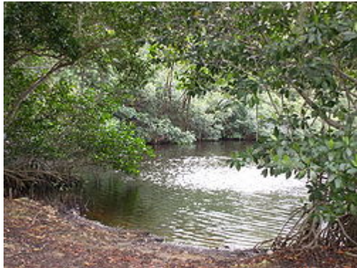
Picture: Artificial or natural lakes as sources of water

The water available at the inflow of a Water Treatment Plant originates from different sources: ground water, rivers, lakes, wells. Accordingly, this water can be contaminated in different ways. Solid particles, dissolved organic carbons, humic acids, germs or micro pollutants can occur in any combination. Numerous dissolved organic carbons absorb ultraviolet light.