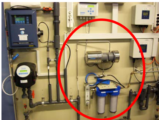
Picture: ColorPlus Bypass in raw water with filtration of samples

With this measurement, the water treatment company has a cost-advantageous online monitoring system of raw water. If an alarm is given, a laboratory measurement is initialized and, depending on the intensity of the contamination, the water can be channelled into the reject. The online measurement results in process reliability and the number of samples which have to be analysed in the laboratory is reduced to a minimum.